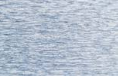
NI - kat. 46%PES,40%PAN,14%VS