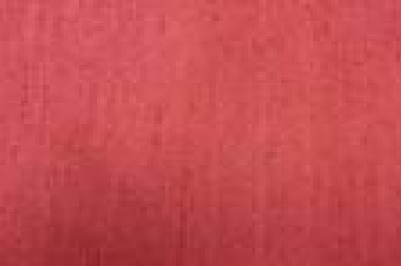
KY – Kat II. PES 30% Acryl 70%