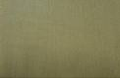
KW – Kat II. PES 30% Acryl 70%