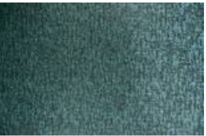
KG – Kat II. BA 30% PES 70%