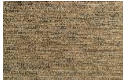
RJ - kat. 38%PES,38%PAN,24%POP