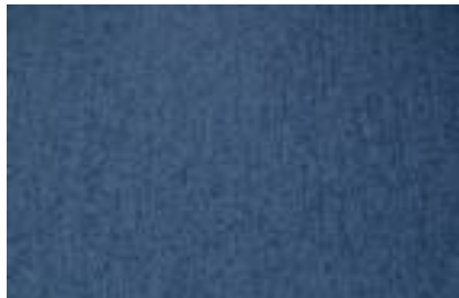
RN - kat. 38%PES,38%PAN,24%POP