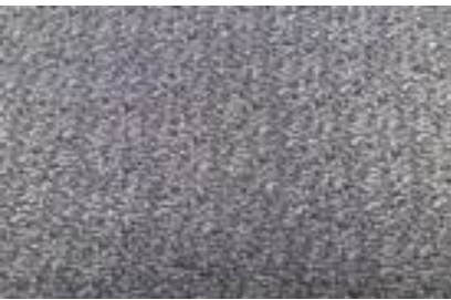
KC – Kat II. BA 30% PES 70%