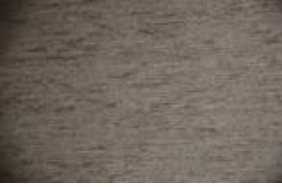
NB – Kat II. PES 30% Acryl 70%