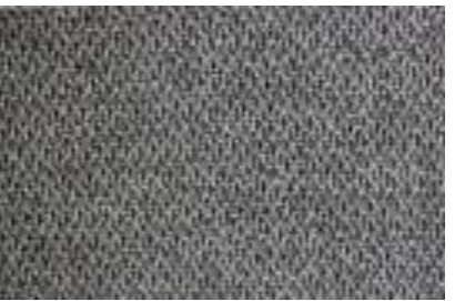
KI – Kat II. PES 100%