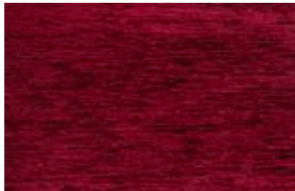
RI - kat. 38%PES,38%PAN,24%POP