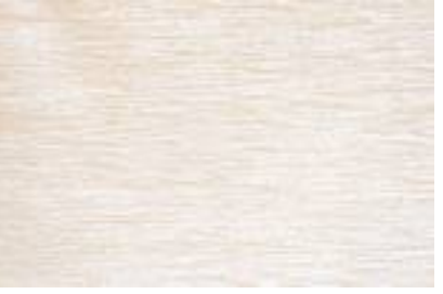
ND - kat.46%PES,40%PAN,14%VS