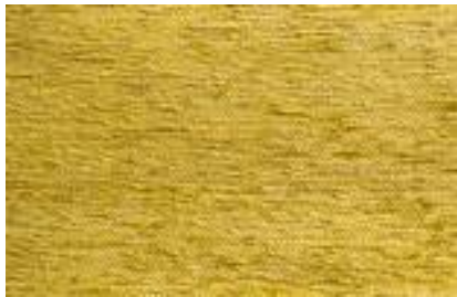
RH - kat. 38%PES,38%PAN,24%POP