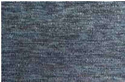
RL - kat. 38%PES,38%PAN,24%POP