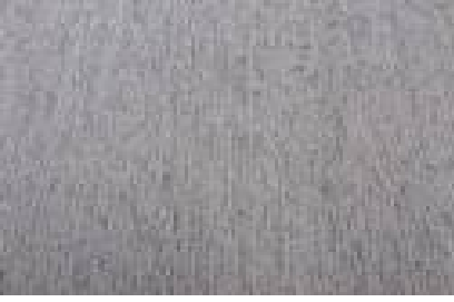
NA - Kat II. PES 30% Acryl 70%