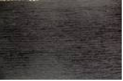
KX – Kat II. PES 30% Acryl 70%