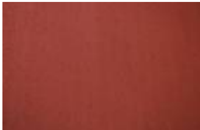
RM - kat. 38%PES,38%PAN,24%POP