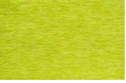
NH - kat. 46%PES,40%PAN,14%VS