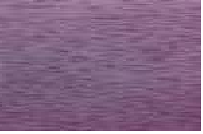
NC – Kat II. PES 30% Acryl 70%