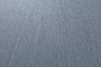
KZ – Kat II. PES 30% Acryl 70%