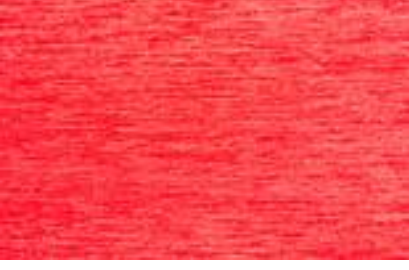
NG - kat. 46%PES,40%PAN,14%VS