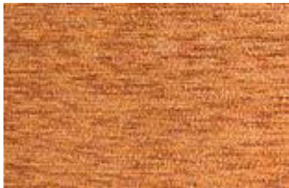
RK - kat. 38%PES,38%PAN,24%POP