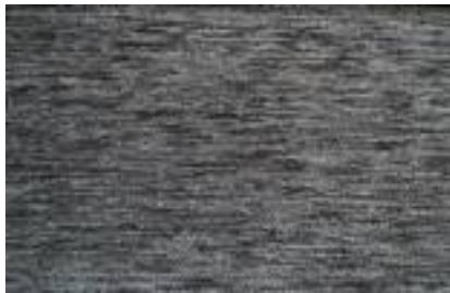
NK - kat. 46%PES,40%PAN,14%VS