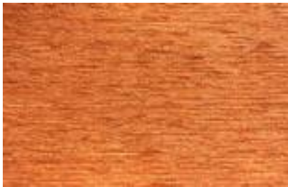
NL - kat. 46%PES,40%PAN,14%VS