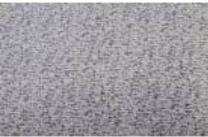
KE – Kat II. BA 30% PES 70%