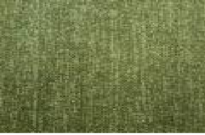
KT – Kat II. BA 75% PES 25%